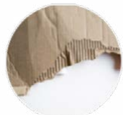
Paper and cardboard